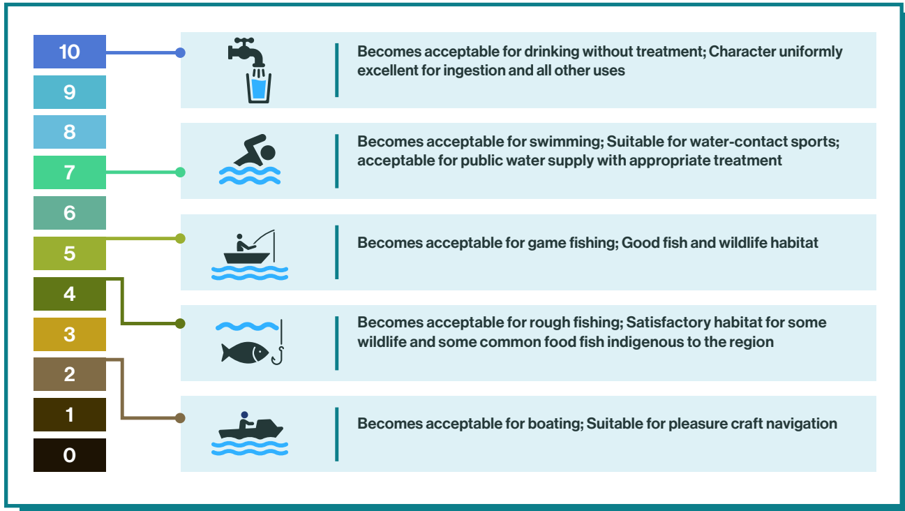
Figure 2. Water Quality Ladder.